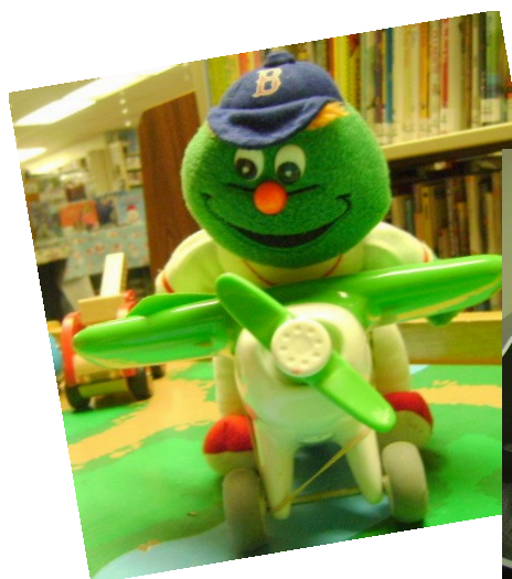
Some pictures from our Stuffed Animal Sleepover in February

We are pleased to announce that all of the yearbooks that the Library has copies of have been digitized and are available online. This project was done free of charge for us by the Internet Archive operating out of the Boston Public Library. You can access the yearbooks online through our website by clicking on the 'Reference and Research' tab and then clicking 'Sutton High School Yearbooks' on the left hand side. The direct link is: http://www.suttonpubliclibrary.org/sutton/yearbooks.asp . The yearbooks are listed by year and once you select one you have many options on how to view it and in what format. We are still looking for copies of certain years to borrow and have digitized. The estimated time we would need to borrow a yearbook would be 3 months. We are looking specifically for 1955 and earlier, 1980, 1982, 1985, 1987, 1988, 1989, 2006, 2008 and newer. We are, of course, glad to accept donations of any of these to add to the Library's permanent collection. We hope that you enjoy looking at the yearbooks as much as we do!